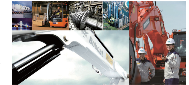
Energy, Casting & Forgings, Construction & Engineering, Construction Equipment, Engines, Equipment, Industrial Vehicle

Doosan has become the global ISB leader based on its world class products and services. In addition, as a true global company, Doosan's overseas employees encompass 50% of its human resources, and overseas sales take more than over 60% of the total sales.