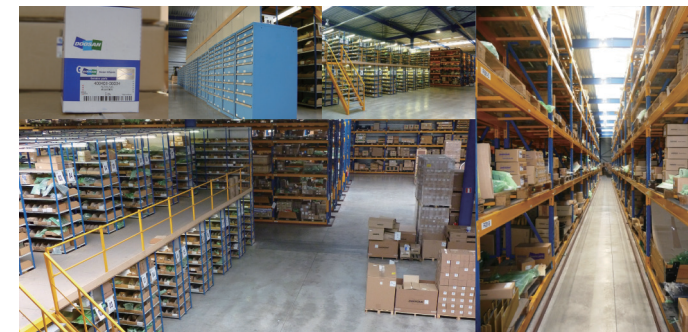
Parts Distribution Centre in Sint-Niklaas, Belgium

Doosan Genuine Parts offer unrivalled reliability and productivity and are guaranteed to ensure you make the most of your investment.